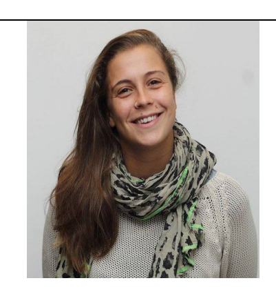
Carolina Tenti Logistics