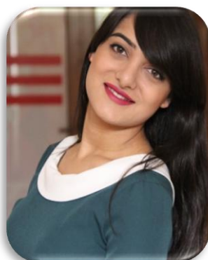
Project Assistant Armenia