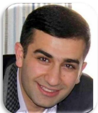
Project Manager Armenia