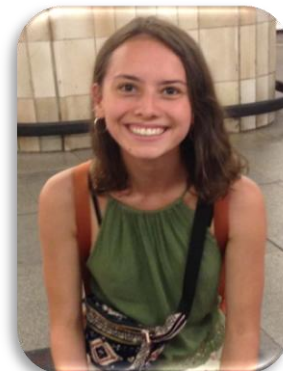
Project Coordinator Germany