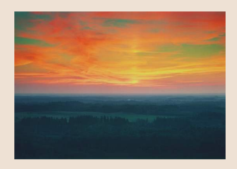
"Latvia - best enjoyed slowly."