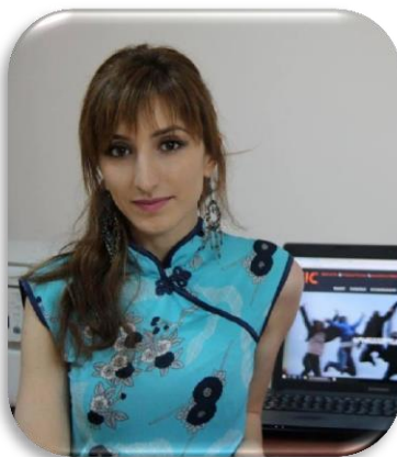
Project Coordinator Armenia