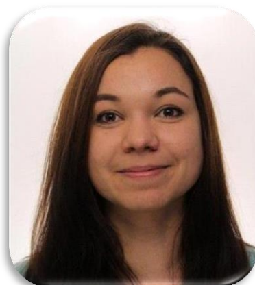
Project Coordinator Sweden