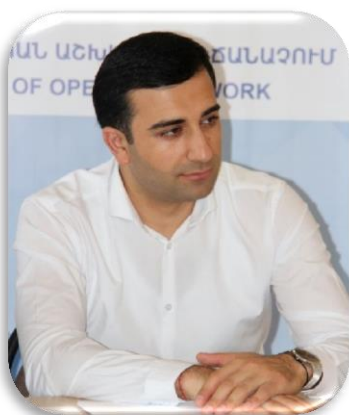
Project Manager Armenia